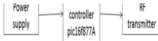
Fig. 1. Transmitter block diagram.

information through RF transmitter to a multiple receiver.